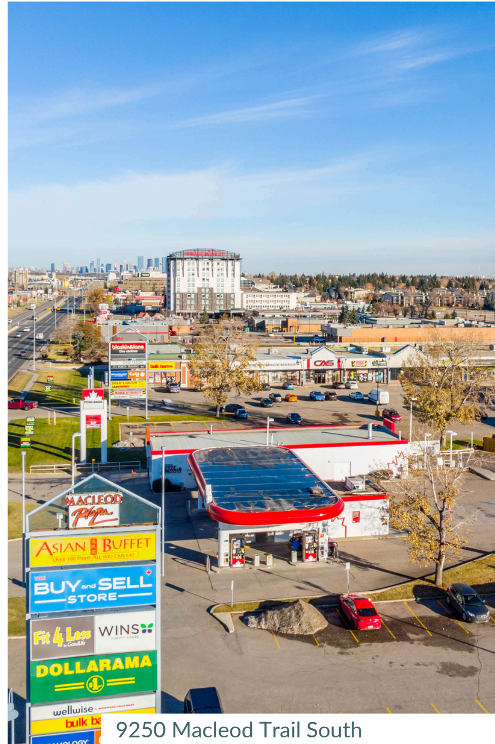
9250 Macleod Trail South