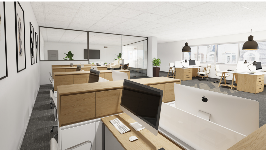
8TH STREET SW