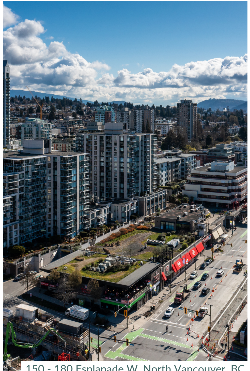
150 - 180 Esplanade W, North Vancouver, BC